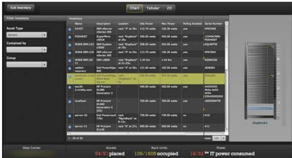
Figure 2.3: Accurately measuring consumption-based on utilization.

The trick with making those assumptions usable is in gathering a database of server configuration and power consumption information. If you had that, you'd be set: You could install a small software agent on each server to measure utilization and report back to a central console, or potentially even use an agentless approach and collect server utilization information across the network. The result might be a console display like the one in Figure 2.3, which shows an inventory of the data center along with a display—at the bottom—of how much power is actually being consumed in the data center.