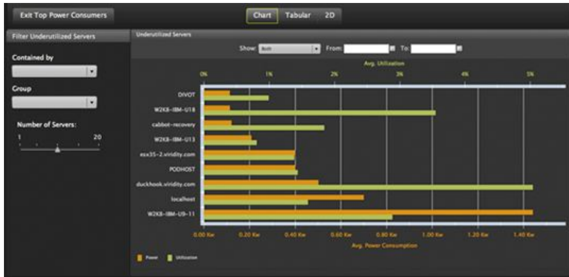
Figure 2.4: Charting server efficiency.