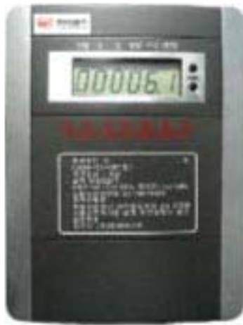
Figure 2.2: Using a meter to measure power consumption.

Unfortunately, this is exactly how we started over-building our data centers in the first place. I have servers, for example, that consume about 70% of their stated requirement when they're doing nothing; as their workload increases, they move to about 90% of the requirement—but few of them, when I've measured, ever consume the full amount stated on the nameplate. So measuring actual energy consumption is much more accurate, and is often accomplished by using a meter of some kind (such as the one shown in Figure 2.2), or by using an intelligent power distribution center (PDC) that has built-in monitoring and measuring capabilities.